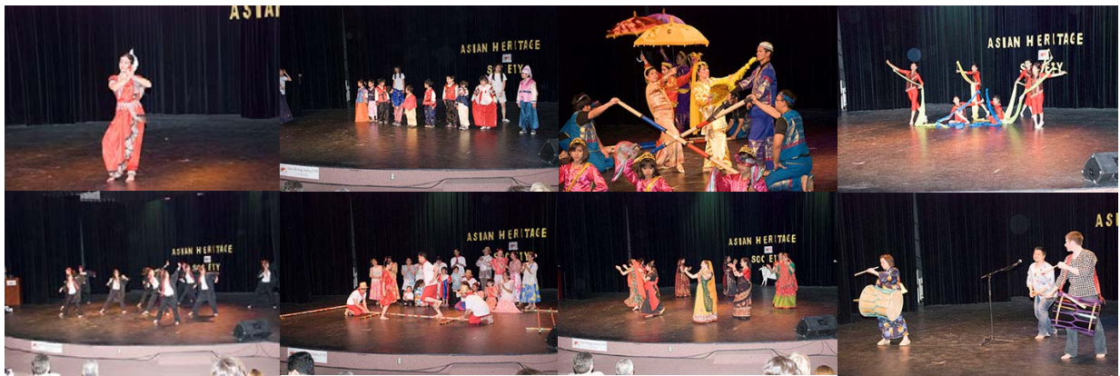
Local Asian Performers at 2008 Gala Night

Department of Canadian Heritage Immigration and Population Growth Secretariat City of Fredericton