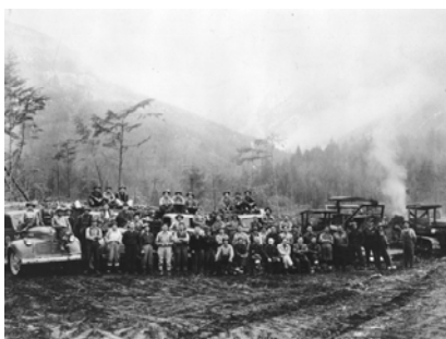
Men's Dormitory during Internment

The B.C. Security Commission established a number of internment camps in the interior of British Columbia. One new "model" camp, Tashme, was built outside of Hope B.C. but the rest were located in abandoned ghost towns in the remote mountain valleys of the interior of B.C. Unlike the internment camps in the United States, the Canadian internment camps (with the exception of Angler in northern Ontario) were not barbed wire encampments but were located in areas so isolated and remote that escape was theoretical at best. These camps were "home" for the Japanese-Canadians from 1942 until 1946. In the meantime, all of the homes, businesses and properties of the Nikkei, including that of Canadian citizens, were sold by the Custodian of Enemy Property, an agency that had originally been established on the promise to the community that it would safeguard such property while the Japanese-Canadians were interned. The proceeds from the sale of their property was used to pay the costs of their internment.