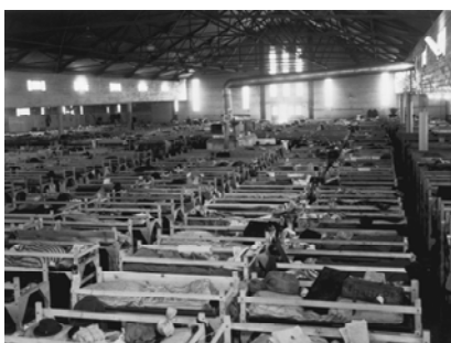
Men in road camp

The B.C. Security Commission established a number of internment camps in the interior of British Columbia. One new "model" camp, Tashme, was built outside of Hope B.C. but the rest were located in abandoned ghost towns in the remote mountain valleys of the interior of B.C. Unlike the internment camps in the United States, the Canadian internment camps (with the exception of Angler in northern Ontario) were not barbed wire encampments but were located in areas so isolated and remote that escape was theoretical at best. These camps were "home" for the Japanese-Canadians from 1942 until 1946. In the meantime, all of the homes, businesses and properties of the Nikkei, including that of Canadian citizens, were sold by the Custodian of Enemy Property, an agency that had originally been established on the promise to the community that it would safeguard such property while the Japanese-Canadians were interned. The proceeds from the sale of their property was used to pay the costs of their internment.